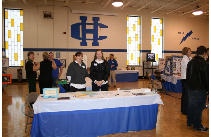
Our annual Scholastic Book fair during Catholic Schools Week at Holy Cross

To start the week off, on Sunday we had a open house from 9-12 a.m. Different groups set up booths such as Scrip, Newspaper, and Boy Scouts so people can ask questions about them. Students led the Mass on Sunday at 10:00 a.m. Our Book Fair is also set up in the Holy Cross Library until Thursday the 29 th .